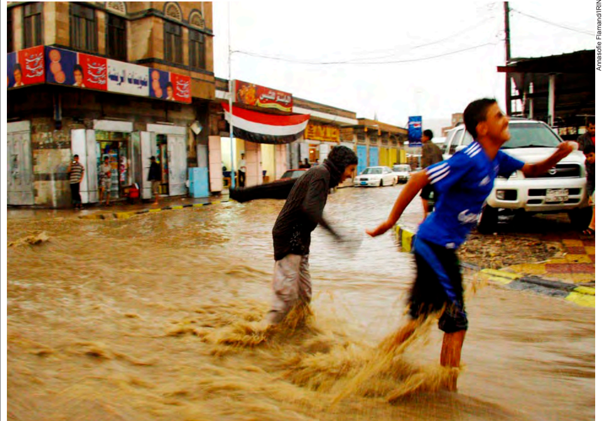
Children play in the flooded streets of Sana'a in May

SANA'A, August 13 (IRIN) — Despite record rainfall in the Yemeni capital Sana'a and other areas this summer, very little is being done to harvest this water to mitigate water shortages, experts say.