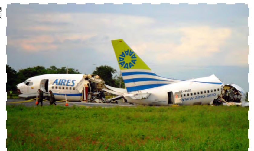
BOGOTA, Aug. 17 -- The wreckage of a Colombian plane that crashed at the airport of the Colombian island of San Andres, on Aug. 16, 2010. One person died Monday after the Colombian plane with 131 people aboard was hit by lightning and made a crash landing on the Colombian island of San Andres, local media reported.