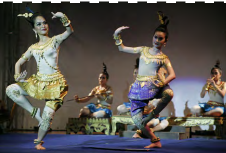
PHNOM PENH, Dancers perform during the opening ceremony of Cambodian Youth Arts Festival 2010 in Phnom Penh, capital of Cambodia, Aug. 7, 2010.