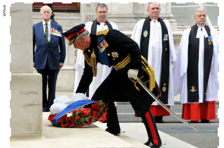
LONDON, Aug. 15 -- British Prince Charles lays a wreath at the Cenotaph at a memorial service to commemorate the 65th anniversary of Victory over Japan or VJ Day, in London, Britain, Aug. 15, 2010.