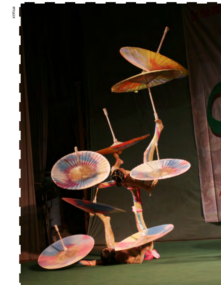
KATHMANDU, Aug. 16 -- Chinese acrobatics perform during a 'Chinese Acrobatic Show' in Kathmandu, capital of Nepal, on Aug. 16, 2010. The four-day world famous Chinese acrobatic show kicked off Monday in Kathmandu to mark the 55th anniversary of the beginning of Nepal-China diplomatic relations. (Xinhua/Bimal Gutam)