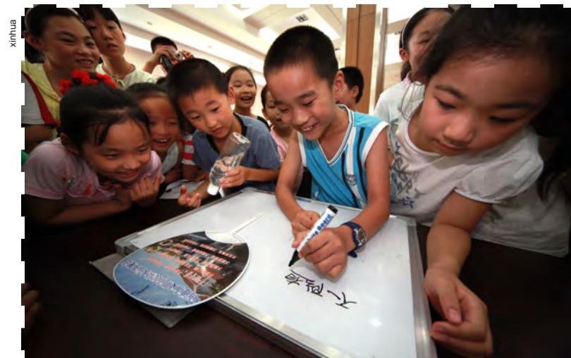
NANTONG, Aug. 8 -- A boy writes with his left hand during a competition for left-handed children in Nantong, east China's Jiangsu Province, Aug. 7, 2010. A left-handed children's salon was opened on Saturday, to mark the international Left-Handers' Day which falls on Aug. 13. The salon will hold various activities to encourage children to use both hands harmoniously, in order to develop the ability of both the left and right halves of the brain.