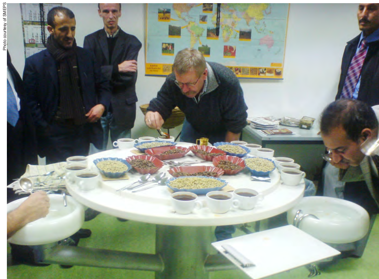
Coffee tasters, or cuppers, taste coffee at a trade fair in Germany earlier this year. A new project to train Yemeni cuppers seeks to ensure that the quality of Yemeni coffee is recognized.

Qaid said coffee traceability is composed of three phases. The first phase is calculating the amount of a certain type of coffee being produced and comparing that to the amount of coffee being traded around the world as being of that type. This determination can be done by anyone, and the only conclusions that can be drawn from it is that there is a certain amount