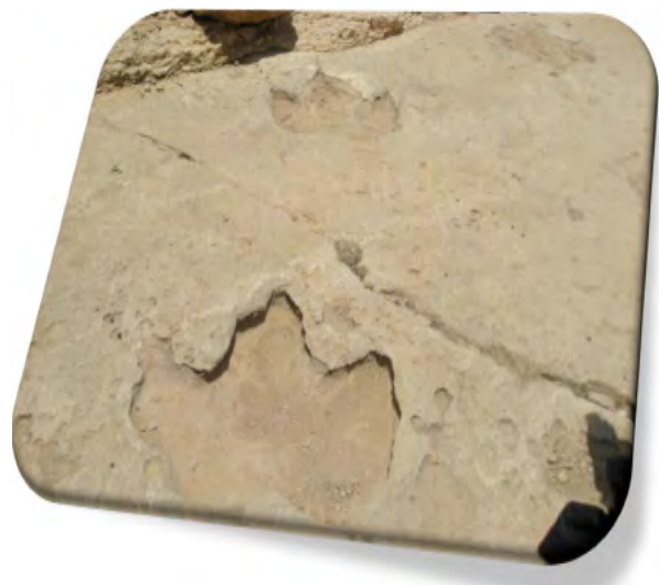
Footprints from the Al-Abayiq track site

"Acknowledging Arhab as a protected area is a step in helping researchers gain more knowledge about dinosaur life, a step towards ecological and geological preservation from the constant urbanization, and provides more sites for ecotourism," Al-Haifi concluded.