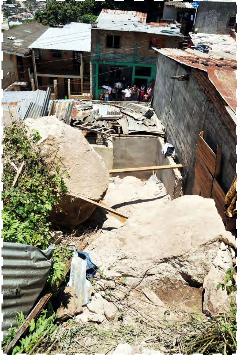
TEGUCIGALPA, Aug. 8 -- Local people gather at the debris after a landslide hit a residential area in northern Tegucigalpa, capital of Honduras, Aug. 7, 2010. A landslide occurred at a residential area in northern Tegucigalpa late Friday night, killing three youths.