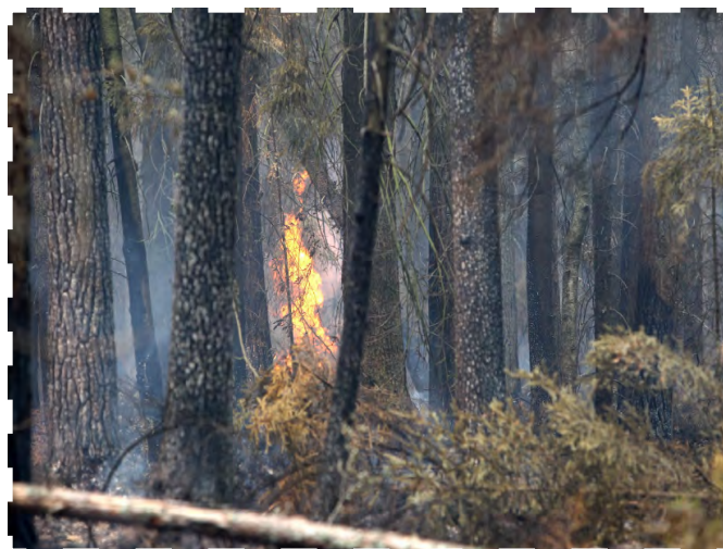
MOSCOW, Aug. 8, 2010 (Xinhua) -- Trees burn in the forest near the village of Orekhovo-Zuyevo, Russia, Aug. 7, 2010. Soldiers and residents were mobilized to put out the forest fire day and night to prevent further disaster.