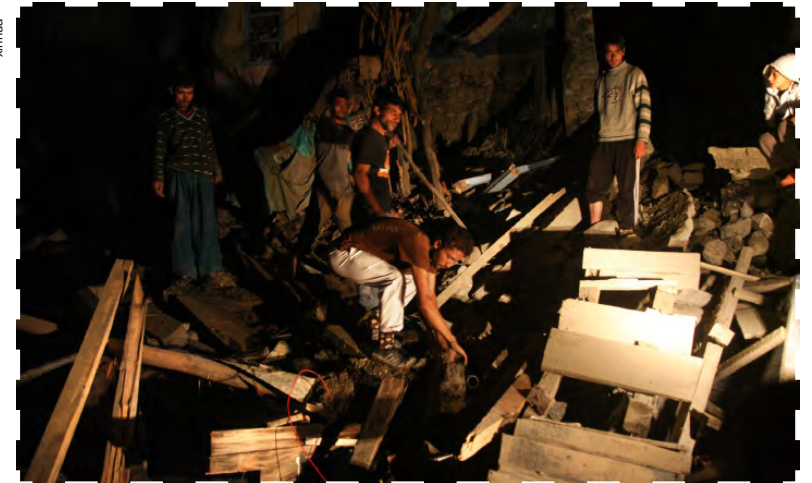
LEH, Aug. 6 -- People remove debris from a damaged house in Kargil, some 235 kilometers from Leh in Ladakh, India-controlled Kashmir, on August 6, 2010. At least 114 people were killed, hundreds of others injured, and many went missing Friday after flash floods hit a major town in the mountainous area of Ladakh in India-controlled Kashmir, said officials.