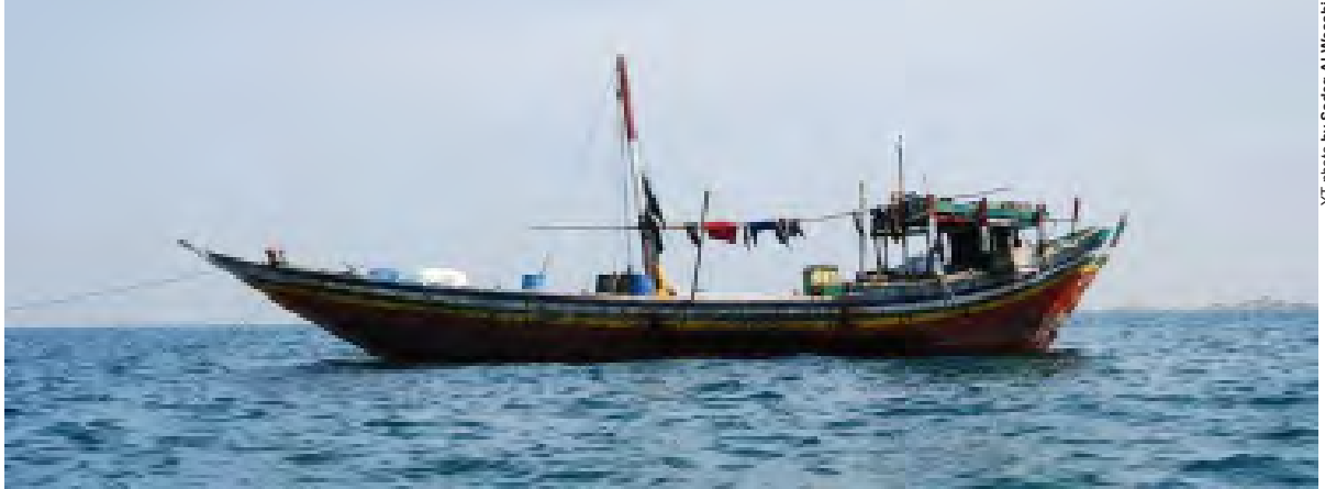
About 400 Yemeni fishing boats have been confiscated by Eritreans over the past four years.