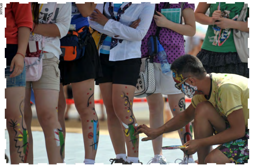
SHANGHAI, Aug. 7 -- A painter does free body painting for tourists at the 2010 World Expo in Shanghai, China, Aug. 7, 2010.