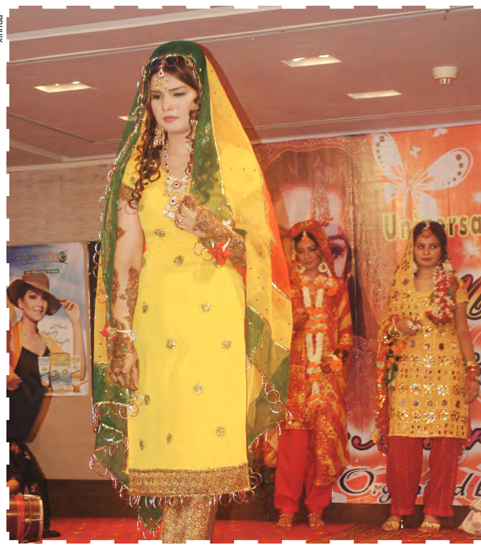
LAHORE, Aug. 7 -- A Pakistani girl walks on stage during Bridal Dress Competition in eastern Pakistani city of Lahore on Aug. 7, 2010.