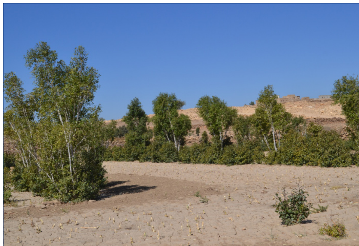
Farms like this one in Al-Sohman area previously grew a variety of crops but now specifically produce Qat.