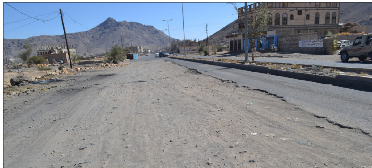
This is one of the many road projects across the country that was never finished. During the political instability of the revolution, laborers lost jobs as contractors struggled to continue.