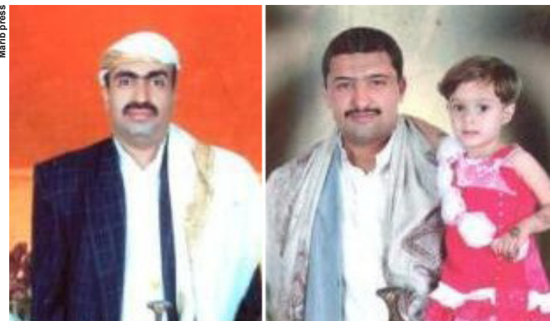
Family photos of two of the Yemeni detainees in Syria.

The Front of Victory broadcast video footage almost immediately, claiming responsibility for the abduction. They accused the Yemeni government of sending the officers