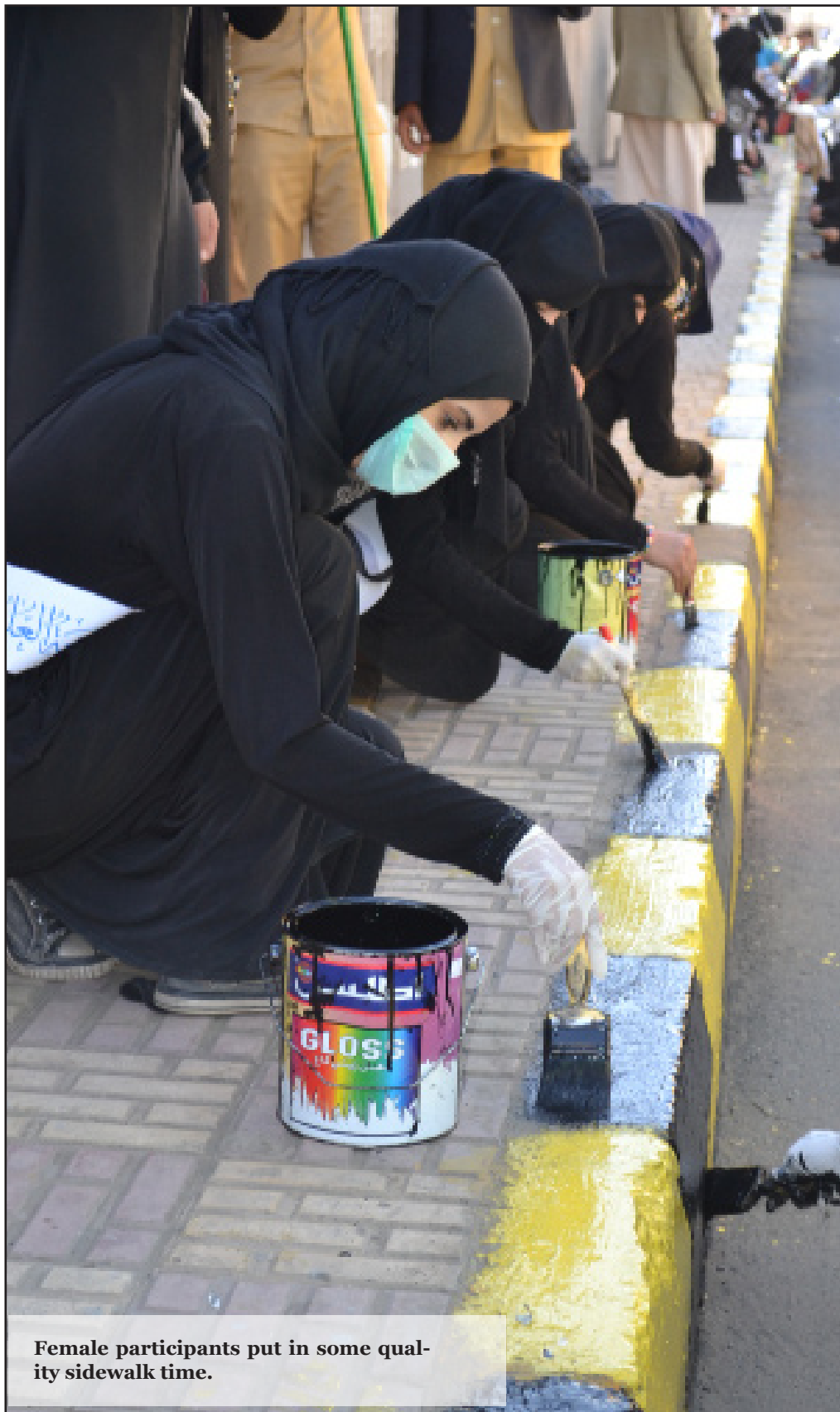
Female participants put in some quality sidewalk time.