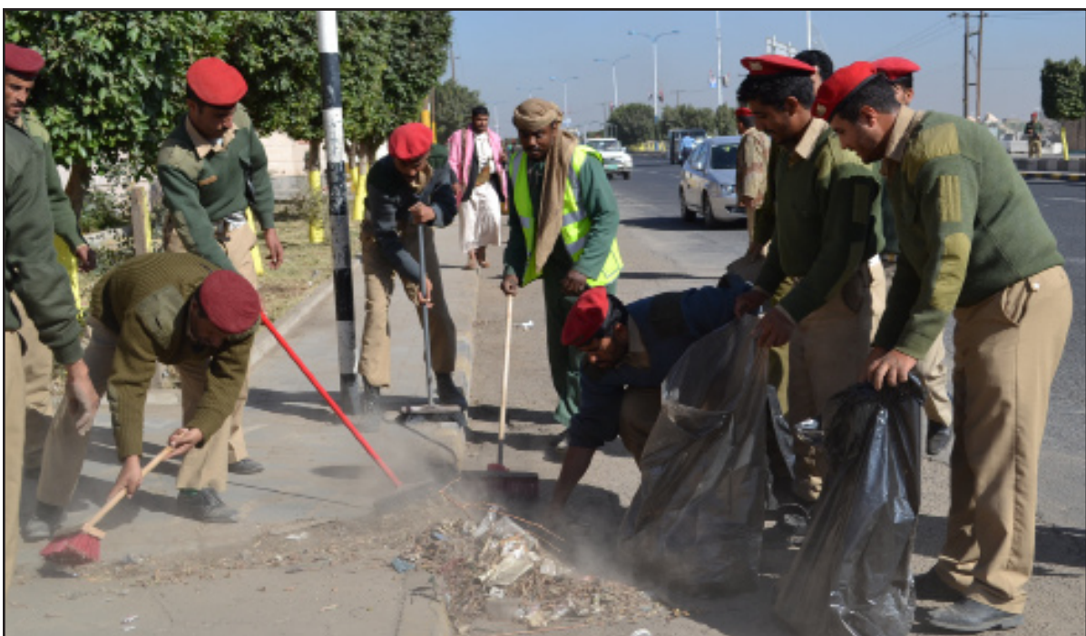
Security forces worked together to clean a street in Sana'a.

▼ Engineers, doctors, and instructor were some of the few occupations that took the day off to participate.