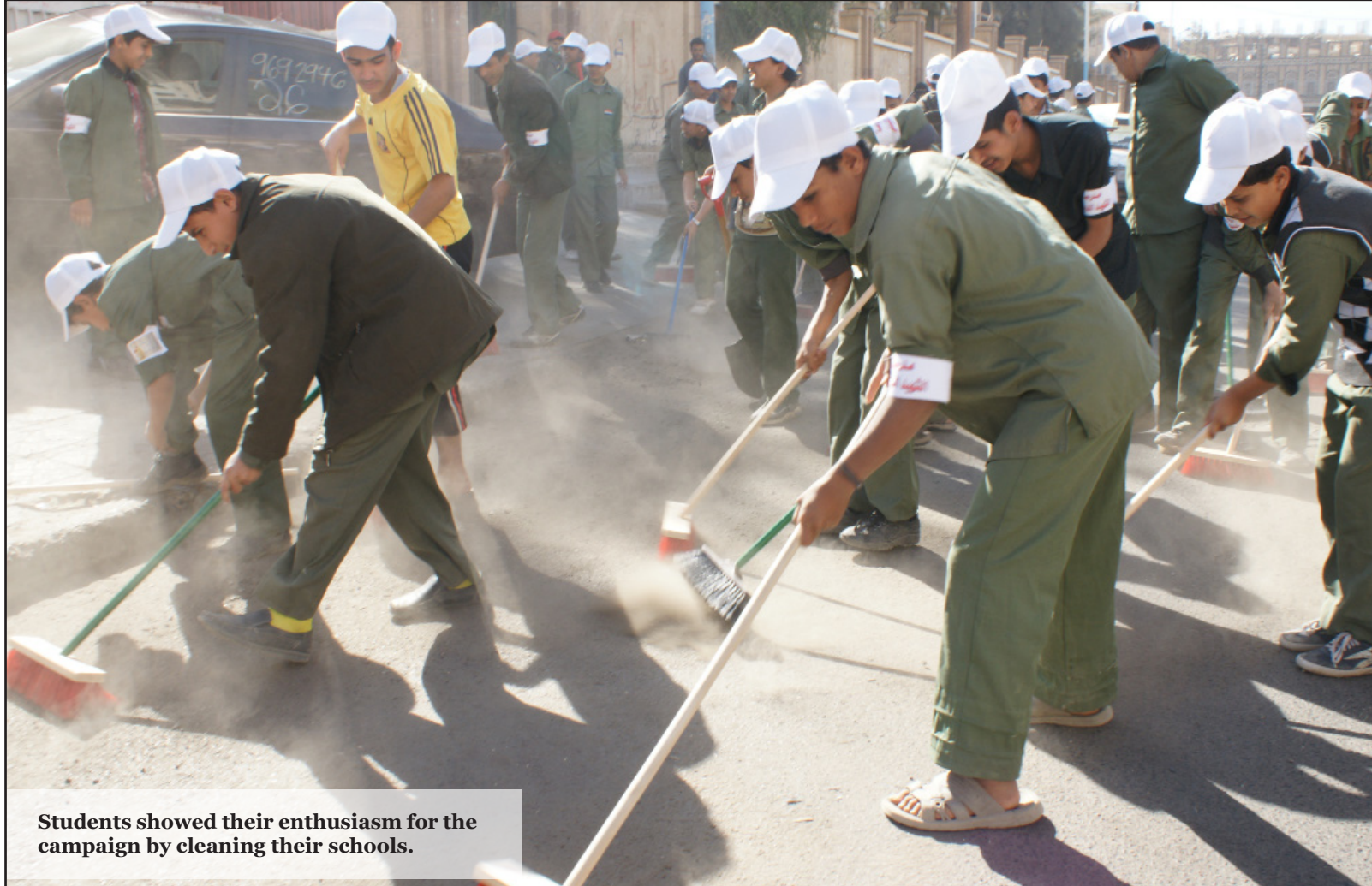
Students showed their enthusiasm for the campaign by cleaning their schools.