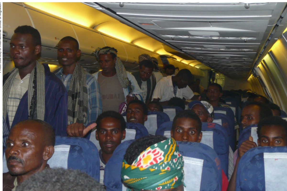
Ethiopian migrants board a plane to go back home after being unable to get into Saudi Arabia.