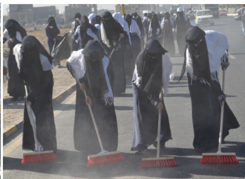
Different social components helped prepare this campaign in terms of providing cleaning tools and distributing them for anyone who wanted to participate in the campaign.