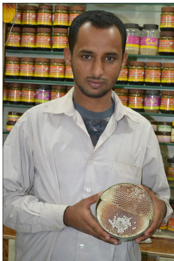
This trader displays a comb full of one of Yemen's fastest growing commercial products.