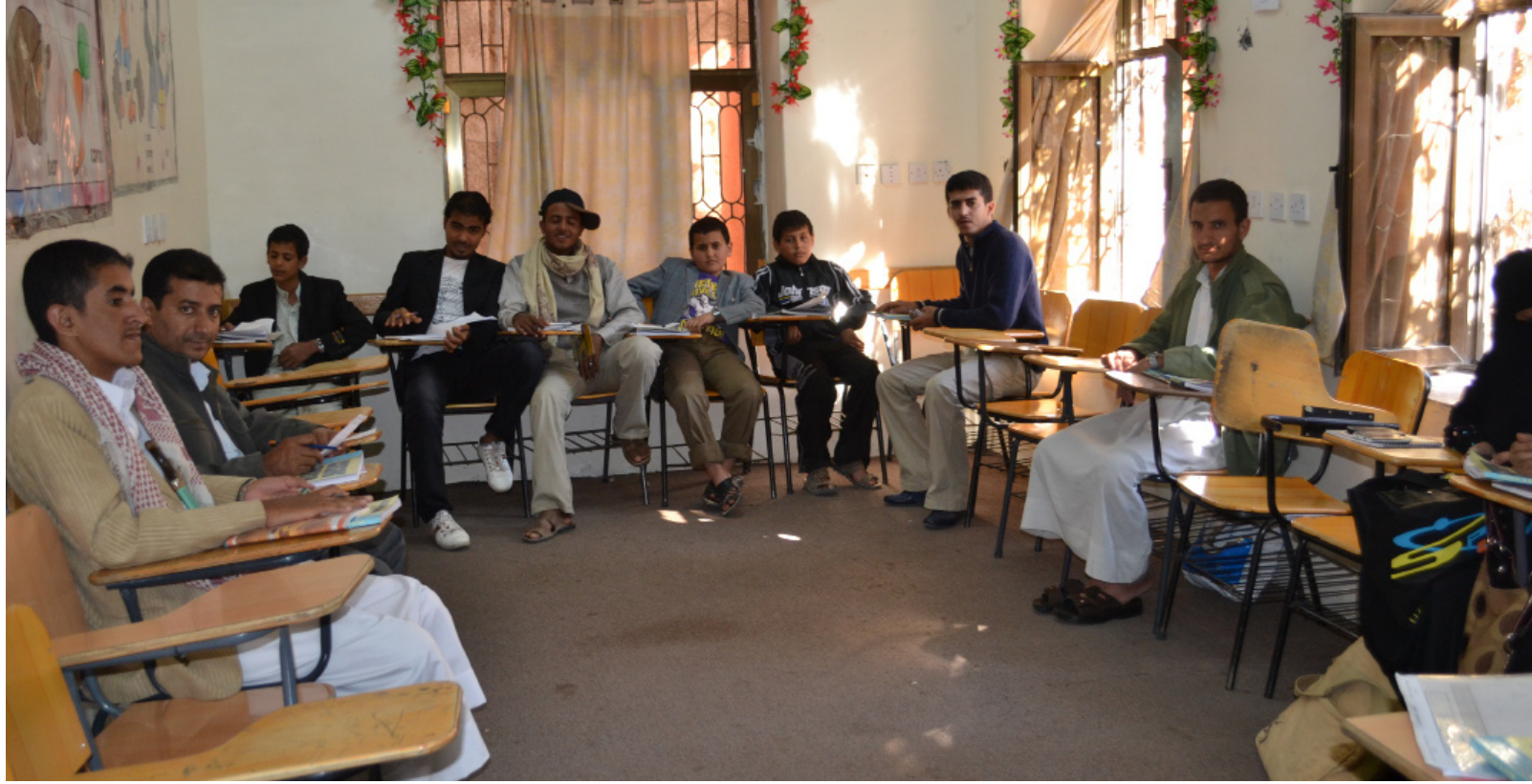
Students consider obtaining TOEFL an important step to better jobs and opportunities

"TOEFL helps to build the knowledge of the students organically because the students are not simply receivers of information. They are the source of the information. This makes the TOEFL certificate