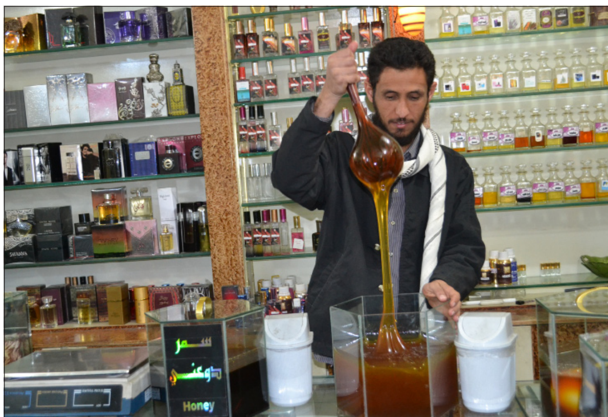
Yemen is gaining a global reputation for the diversity of its honey products. Sidr is typically the most expensive variety but it also considered the best quality.

According to Mohammed Bashuaeb, a Yemeni honey trader, Yemeni honey is noted for its high quality due to the type of bees used as well as the variety of pastures. The diversity of hot and cold areas where it is produced, gives Yemeni honey a unique and highly-prized