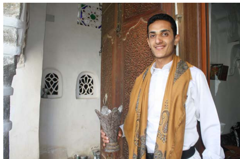
Yemenis are well-known for their hospitality and welcoming nature towards visitors, but currently few are privy to it.