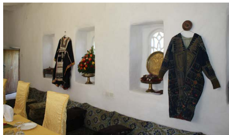
Hotel and restaurant owners do not know how much longer they can stay open if there is not an influx of tourists soon.