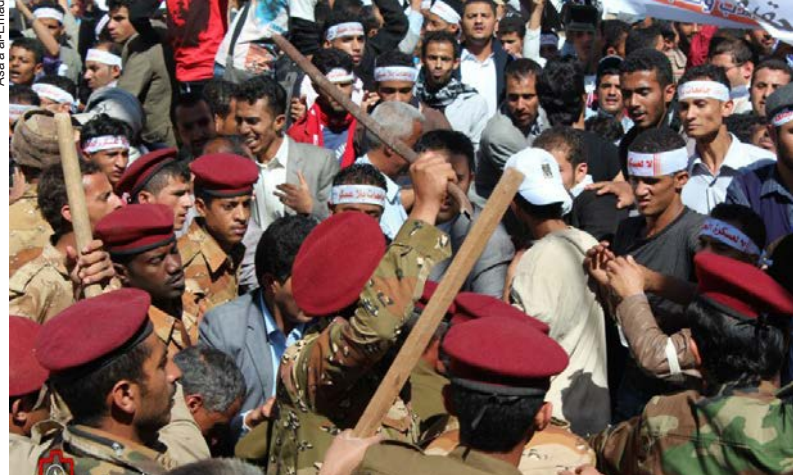
Protestors and security clash during the protest.

Al-Shearjabi praised Al-Ahmar's cooperation in providing an appropriate ground for the educational process and also his determina-