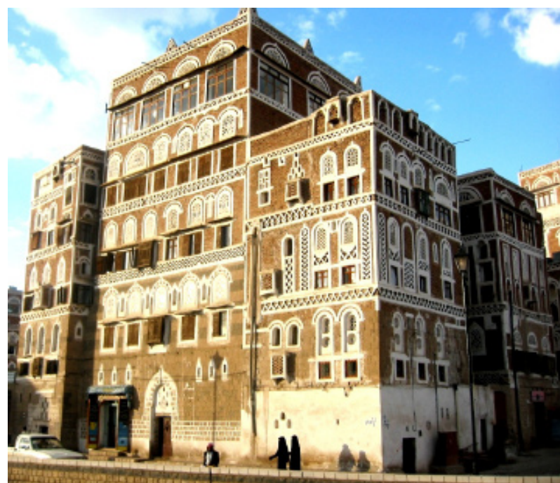
In 2009 over 1 million tourists came to Yemen.

With many countries still issuing travel warnings for Yemen, the silver, jewelry, perfume and honey dealers in Old Sana'a say the coming year will be a test to whether they will continue to be able to survive in a tourist attraction without