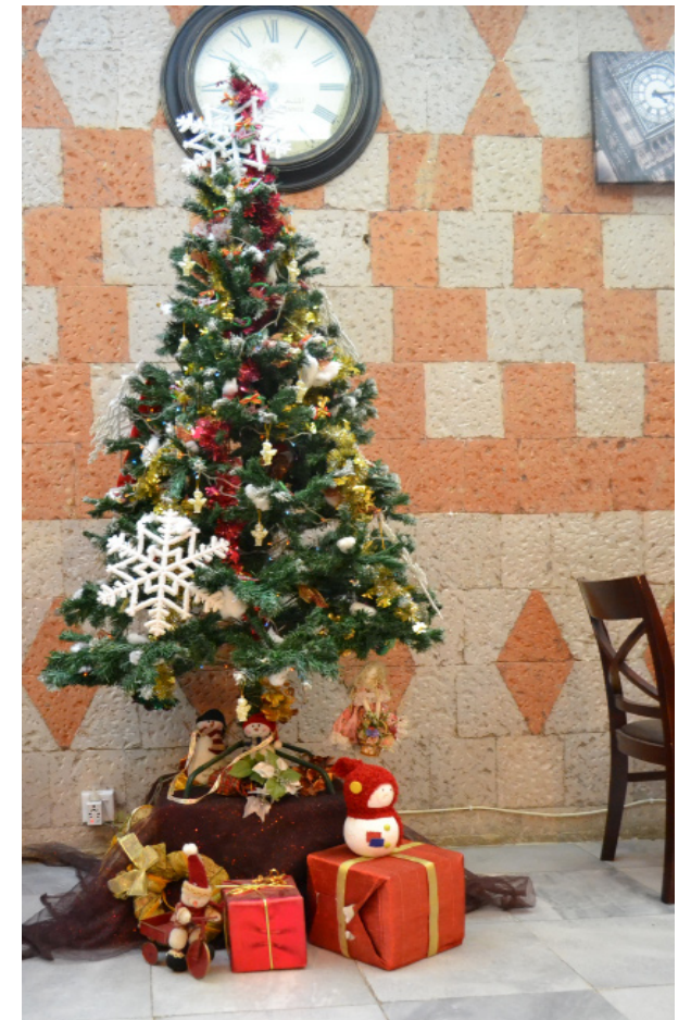
The Coffee Corner cafe provided some the comforts of home during the Christmas holiday.

"There are lots of Yemenis in Michigan. When we have religious occasions, we gather the Yemeni community. We experience the same rituals that we do at home. Some Americans celebrate with us. This accustoms them to the situation outside [the U.S.]," she