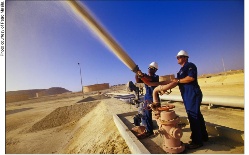
Petro Masila employees 1,000 employees and is looking forward to taking over new oil fields and expanding its operations.

"We are committed to international standards in oil exploration, and in fact, we have produced an additional 1.5 million barrels more than what we had expected. Now, we look forward to taking over explora-