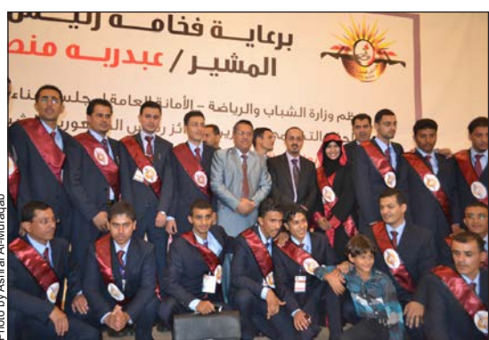
Group photo of award winners and officials.

tor for the ceremony, said that 35 percent of the participants in 2012 were females. This is the highest percentage since the President's Awards started 14 years ago.