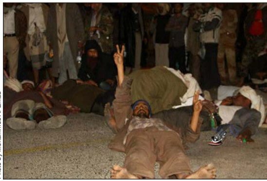
Protestors set up camp near Al-Sabeen Square.

"The military forces broke the sit-in 30 hours after the siege im-