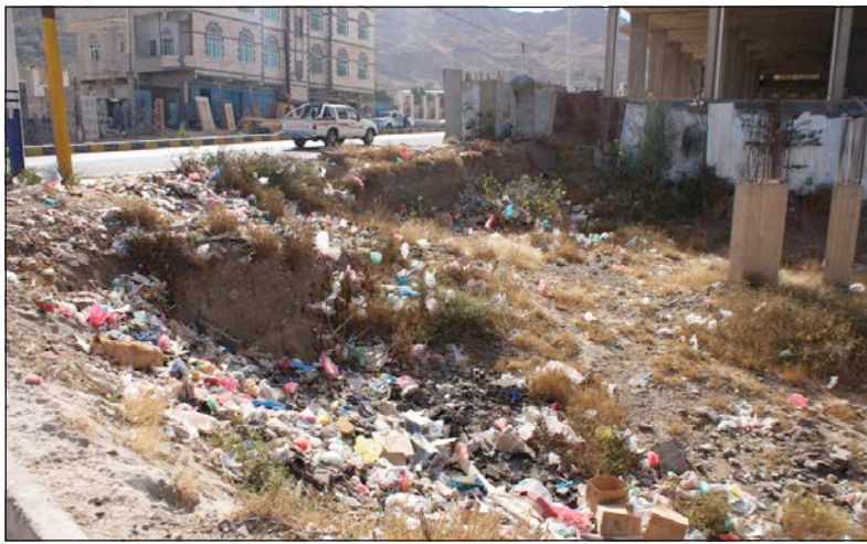
Unfenced piles of trash accumulate throughout the city.

Neighbors complain these communal trash dumps are attracting stray dogs and insects and are an eyesore for the neighborhood.