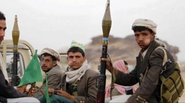
Despite a truce between the tribes of Bani Al-Harith and Bani Hushaish, fighting has broken out again.

Locals say they expect the death toll to rise as they await the outcome of tribal mediations