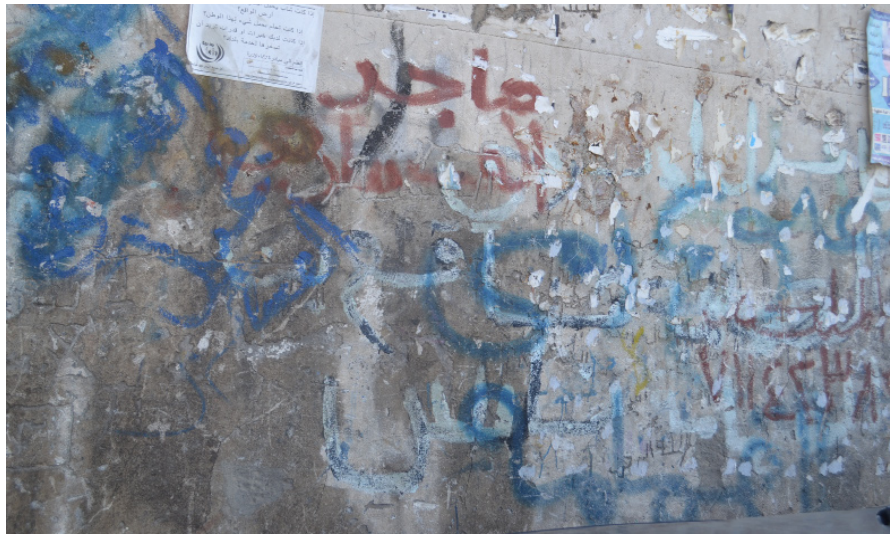
Not everyone appreciates the street art, which has grown following the 2011 uprising. One local calls the graffiti "an eyesore."

"How do they benefit from this conduct? It is only an eyesore, par-