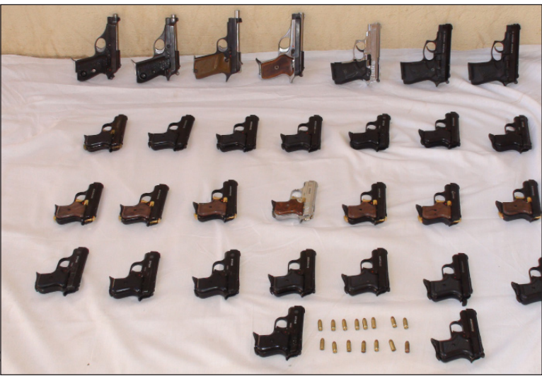
Increased security measures have resulted in the seizure of tens of thousands of illegal weapons.

This is the third apprehended shipment this year that Yemeni