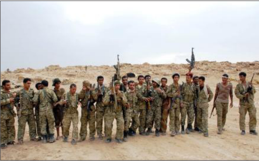
Military men operated outside their commanders’ control when they set-up unofficial checkpoints in Marib.