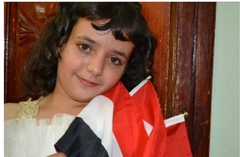
One young participants celebrated her performance backstage with Yemeni flags.