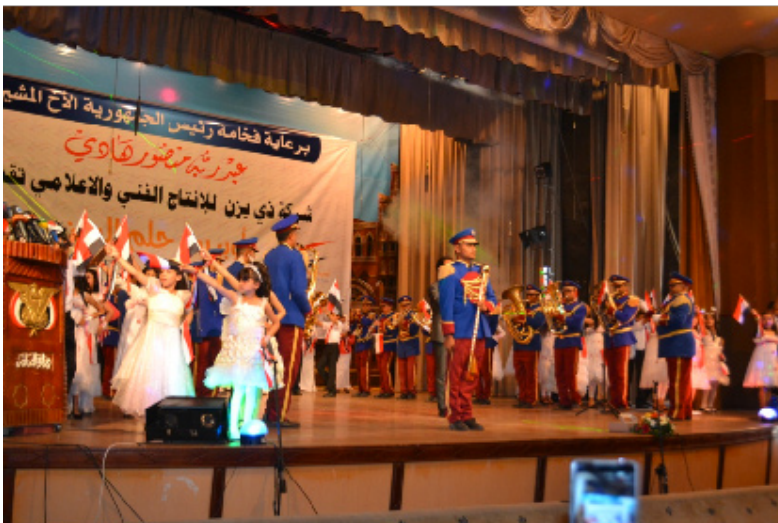
Students of all ages took to the stage to try out their acting and singing skills.