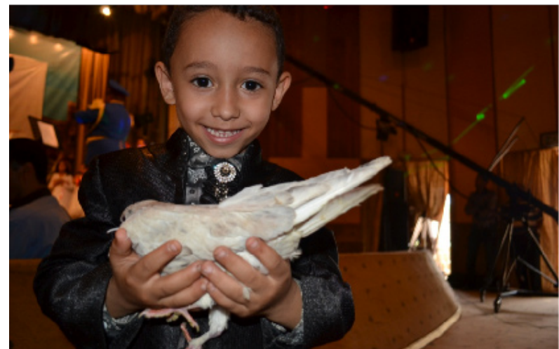
A dove was set free at the conclusion of the performance, as a symbol of peace.

"We are so happy, we are proud, we want to do this one more time," they said.