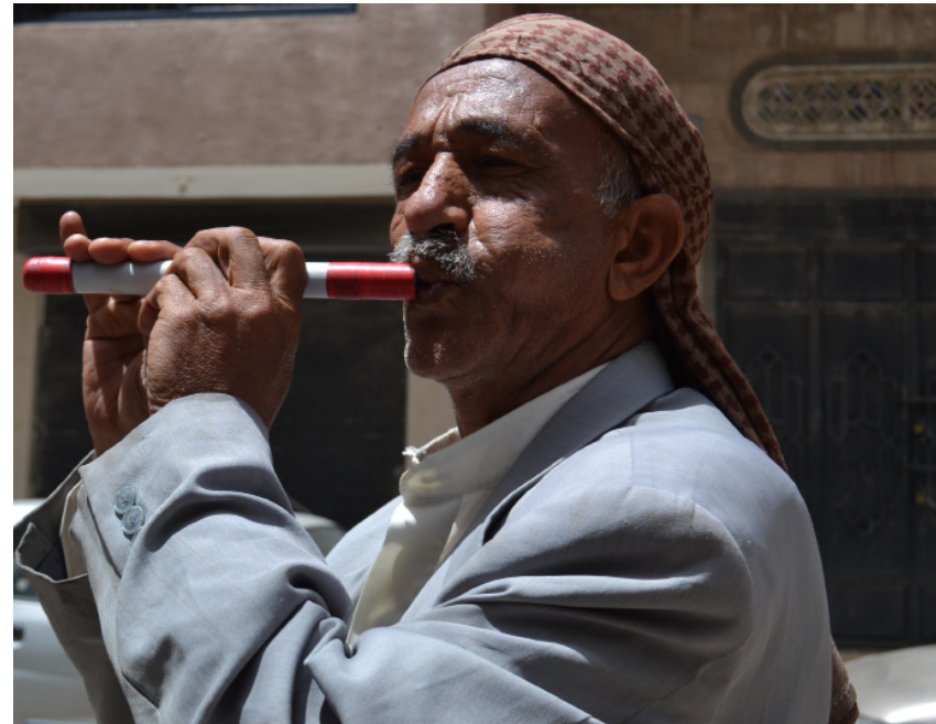
For most of his entire life, the seasoned musician has depended on his copper flute for his livelihood.