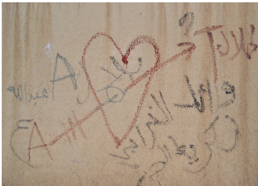
An anonymous profession of love has been scrawled on this wall.