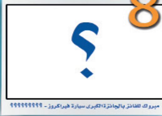
ميروك للفانز بالجائزة الكبرى سيارة فيرا كروز - 999999999