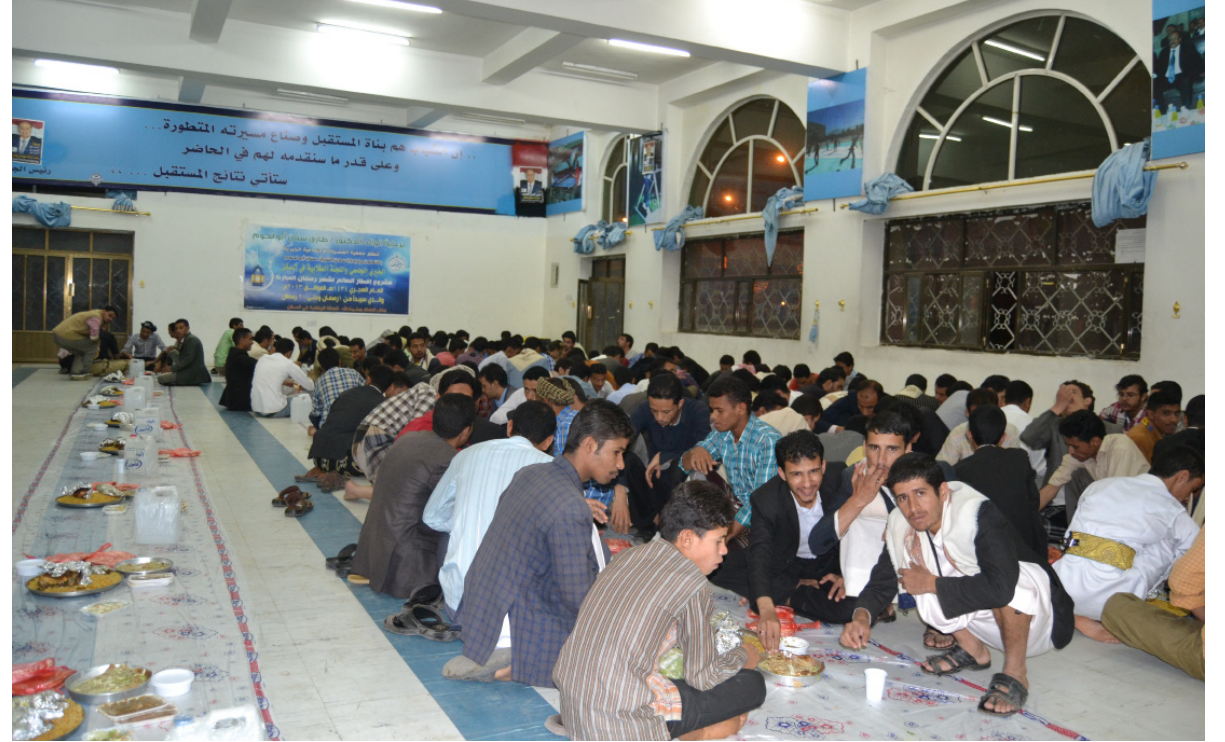
Students, studying in Sana'a and far from their families, come together for free group iftars at a community center.