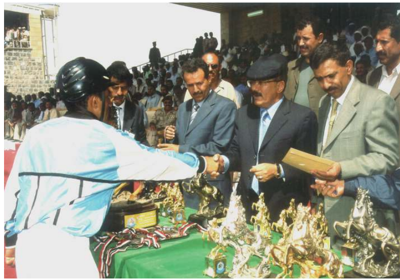
President Saleh rewarding some of the winners in the Husseinia Festival.

"Al-Zaraniq" was an adjective branded upon Tihama desert inhabitants. Al-Zaraniq tribesmen characteristics have not changed since olden times, when they were known to possess slim physiques and were famed as good runners.