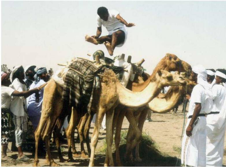
A participant jumping over four Camels in the festival.

On Saturday, President Ali Abdullah Saleh inaugurated the Husseinia Racetrack for horse and camel racing. Incorporating separate tracks for each, the venue was designed according to