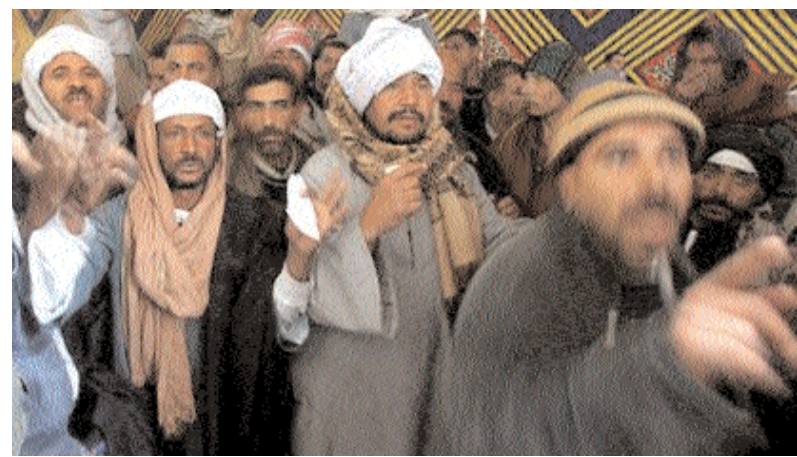
Egyptians wait in Cairo on Monday to hear news of their relatives who are missing after a ferry sank outside the Red Sea port of Saf

Fire broke out in the ships parking bay as it was about 20 miles from the Saudi shore, survivors said Sunday. The crew decided to push across the Red Sea to try