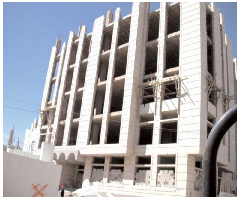
The building in which the police raped the Somali women.

Another refugee described his misfortune and that of other refugees with the UNHCR, which was supposed to protect and look after them, but turned out to be a foe instead. The man