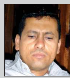
By: Mustafa Ragih

Authorities frequently argue that a change will bring fundamentalists and chaos alike. But such