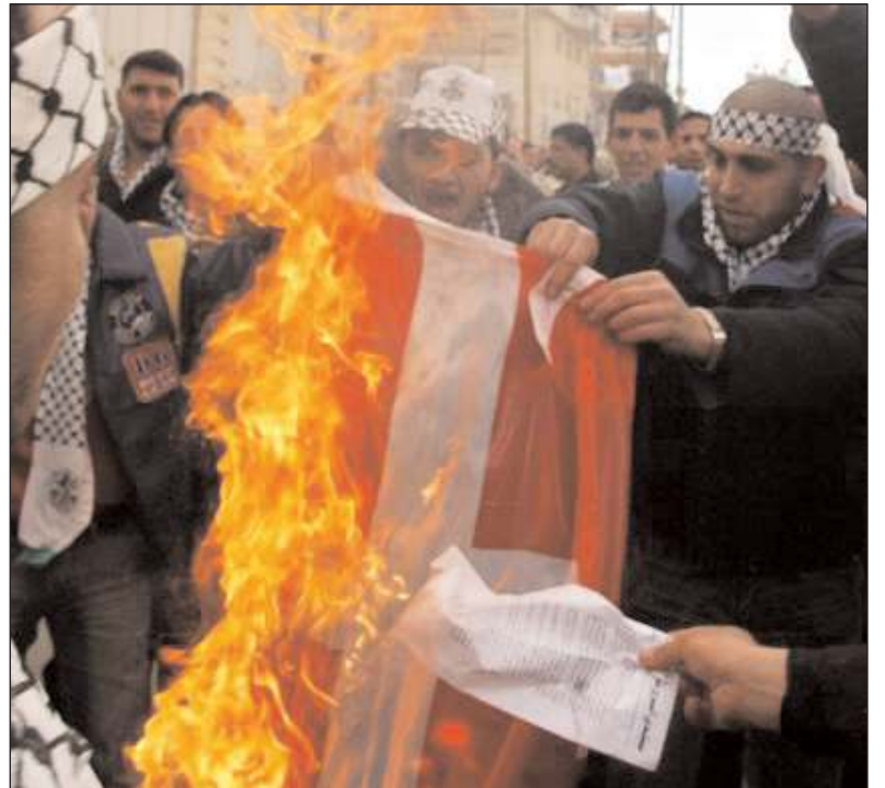
Angry over blasphemous cartoons published by a Danish newspaper, Muslims burn piles of boycotted Danish goods as an expression of their wrath.

The feeling of boycotting Danish goods appeared very strong among Yemeni consumers. At the same time, Yemen's government and Parliament have strongly criticized the Danish press's blasphemy against the Prophet Mohammed.