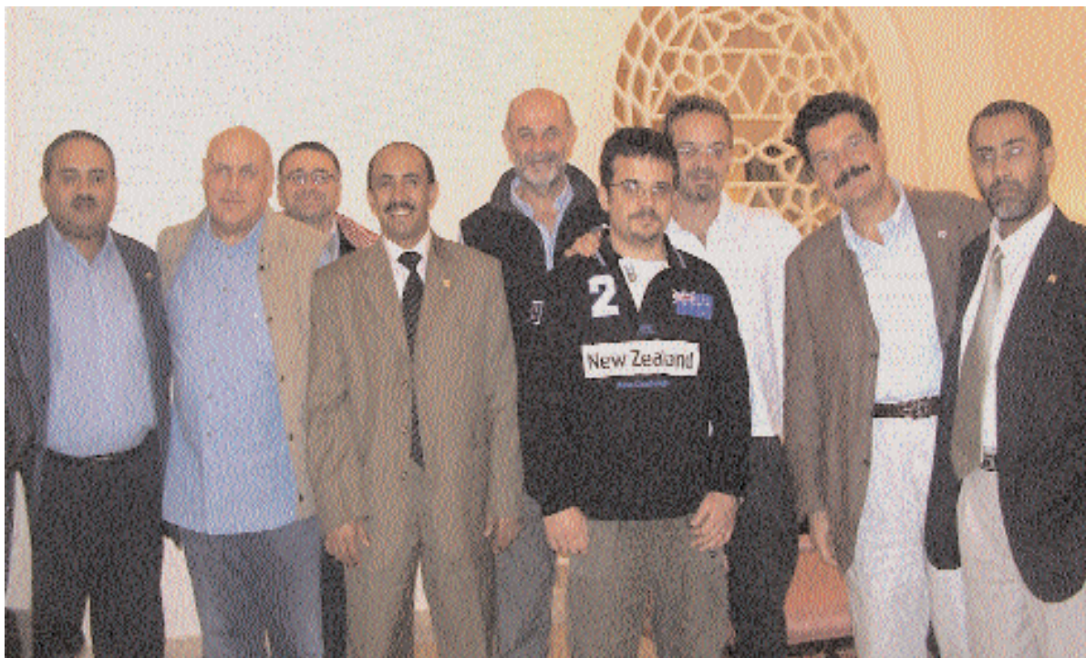
Members of the Italian medical delegation with doctors in Aljumbhori hospital.