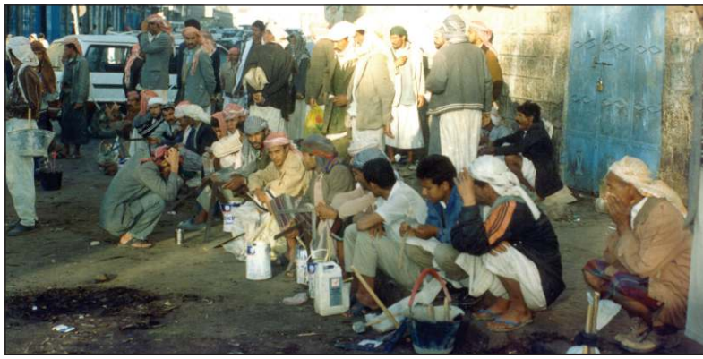
Thousands of unemployed, especially unskilled laborers, wait long hours, if not days, for a chance at being hired for temporary work.

The ministry plan includes finalizing a version of the human resources development strategy to refer it to the govern-