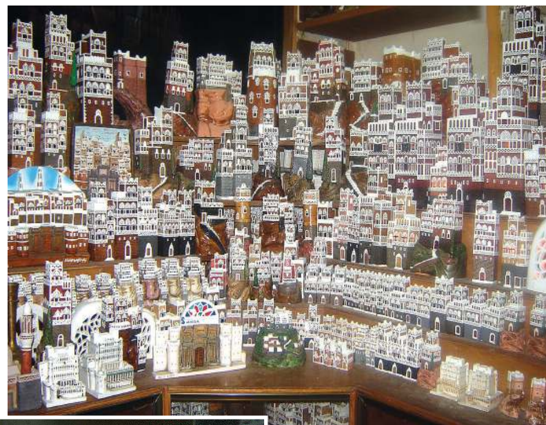
A view of miniature houses that resemble old sana'a city houses

Some have tried to portray the area by photographing its buildings, markets and neighborhoods and sending such images worldwide. Ten years ago, it occurred to some Yemeni craftsmen that it would be good to depict the Old City in the