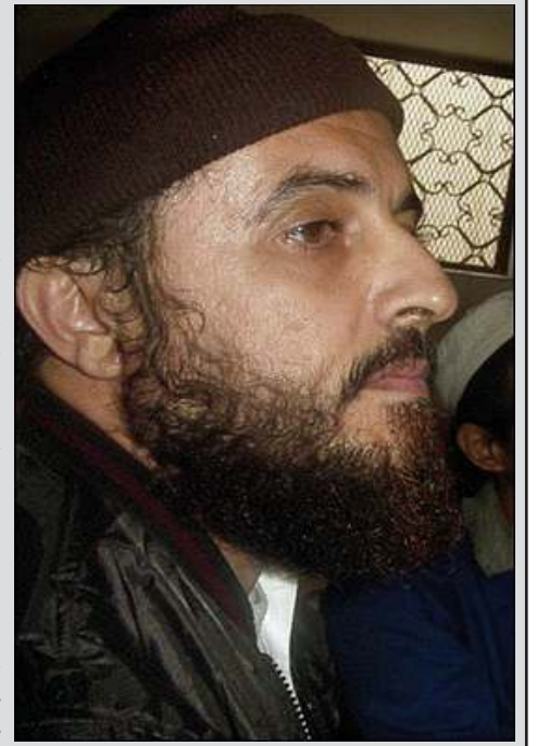
Jamal Al-Badawi behind bars.

Yemeni security forces set up checkpoints throughout Sana'a trying to catch the fugitives before they attempted hiding in mountainous tribal territories far from Yemeni government control. Security arrested approximately 200 of the fugitives' relatives and associates for investigation. A security official said combined operations are taking place in areas considered to be extremist group strongholds. The official confirmed that fugitives' relatives and friends have been arrested. Additionally, police distributed