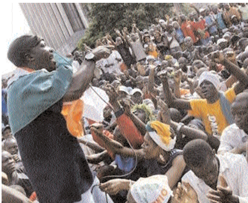
Charles Ble Goude, leader of the Young Patriots - a group fiercely loyal to President Laurent Gbagbo - talks during an anti-U.N. demonstration in Abidjan, Ivory Coast on Jan. 19.

ABIDJAN, Ivory Coast - Leaders of last month's fierce anti-U.N. riots in Ivory Coast have shrugged off the sanctions the world body is expected to impose on them on Tuesday, saying the measures will not prevent more street demonstrations.