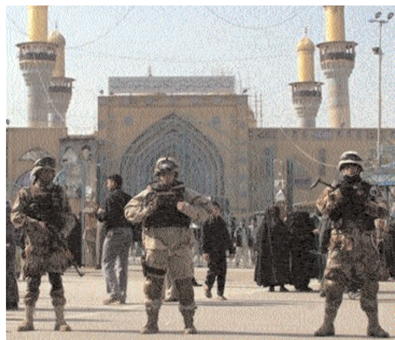
Iraqi soldiers stand guard in front of the Shiite shrine in Baghdad's Kazimiyah northern suburb, Monday, Feb. 6. Iraqi authorities set up new checkpoints and warned inkeepers to watch for suspicious people - all part of security measures to protect Shiites marking the holiest day of their calendar this week. The measures were put in place Sunday ahead of the feast of Ashoura to prevent a repeat of suicide bombings by al-Qaida in Iraq.

Early Tuesday, a roadside bomb struck a pickup truck south of Baghdad and killed two Iraqi civilians, while gunmen shot dead a sup-