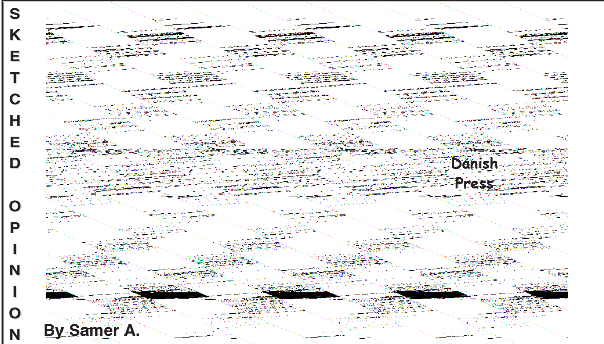
By Samer A.

The Bush administration's efforts in 2005 remained focused mainly on the electoral realm. In Egypt, U.S. officials