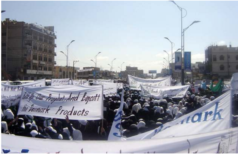
Yemeni women in a demonstration last week calling for boycotting Danish products

"We as Muslims respect all religions and prophets. You will never see a Muslim say or do anything to insult a different religion. This is how Islam teaches us to act when dealing with other religions," he added. Islam is Denmark's second largest religion after the Protestant Lutheran church followed by 80 percent of the population.