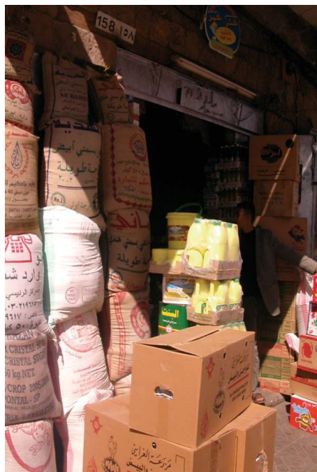
Fluctuating foodstuff prices destabilize Yemeni markets

The sugar price is a blow to Yemeni families' budgets due to its increase from 70 to 130 Riyals per kilo. Families can expect new pricing surprises, as they will have to pay more for sugar, at the expense of other foodstuffs, and deprive