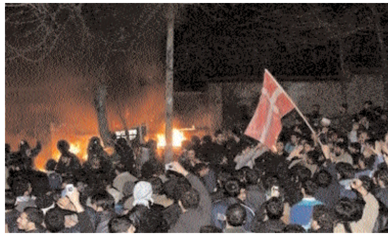
Protesters burn a Danish flag in front of the Danish embassy in Tehran, Monday Feb. 6. Police used tear gas to disperse hundreds of angry protesters who hurled stones and fire bombs at the Danish Embassy

Afghan troops shot and killed four protesters, some as they tried to storm a U.S. military base outside Bagram - the first time a protest over the issue