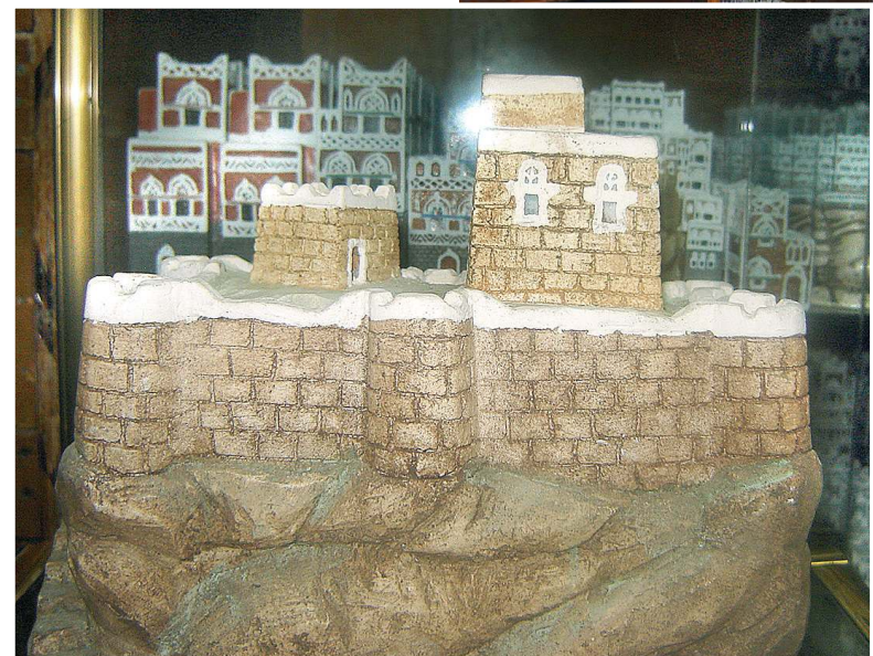
A model of a small mosque in a village

Miniatures generally are made of plaster, which is poured into molds until it dries. Afterward, having taken the form of a house, the plaster is removed from the mold. The cast then is hand painted and windows and doors affixed, with the complete work resembling a real man-made construction. Miniatures vary in size from small to medium to large.