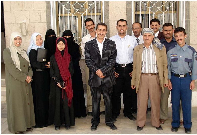
The two facilitators and Yemen Times staff take a group photo as smile prove the successful outcomes.

The session highlighted four main problems, mostly regarding administrative, technical, financial and professional problems, which many companies face. One particular training exercise had participants classify their