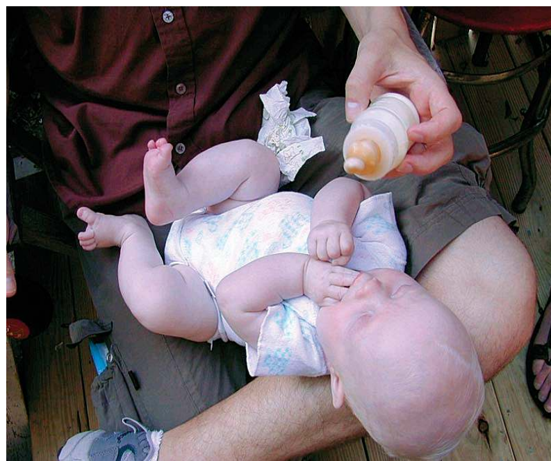
Doctors confirm that infants who don't feed on breast milk are prone to infectious diseases because their immunity is weak and artificial milk bottles get contaminated.

Thanks to its contents, breast milk promotes sensory and cognitive development in addition to protecting infants against infectious diseases such as gastroenteritis (inflammation of the stomach and intestine) and septicemia (bacteria and its toxins in the blood), as well as several chronic diseases, because breast milk has antibodies and