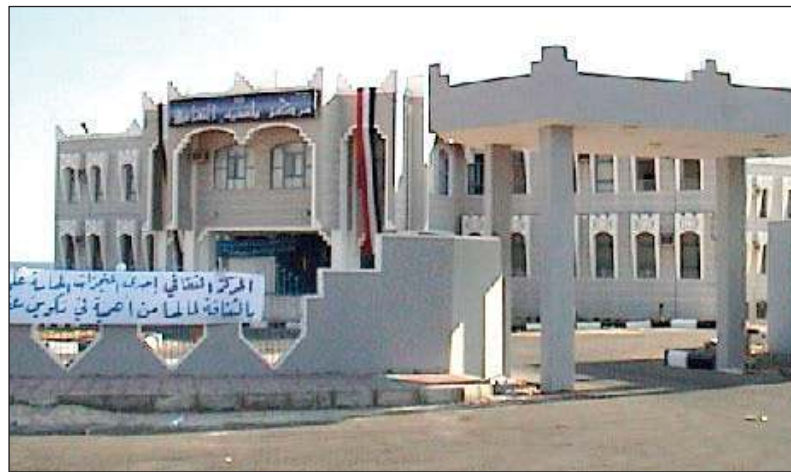
Balfageh Center for Culture and Information Technology

It will push the country a few steps forward in terms of e-readiness," he predicted.