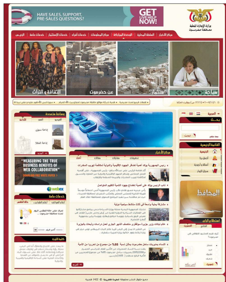
The website of Hadramout governorate