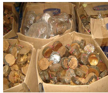
Anti-personnel land mines.