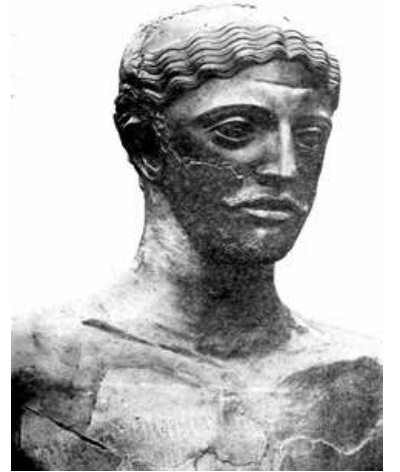
King Dhammar Ali Yahbr

Interpreters and historians describe Dhul Qarnayn with many names that have no authentic roots. However, as Al-Kumaim writes, the most valid lineage for Dhul