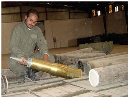
A tank's shell taken out of its casing.

At a Thursday's news conference, Interior Minister Dr. Rashad Al-Alimi promised that attendants may visit these storage facilities in order to portray the success of the Ministry in con-