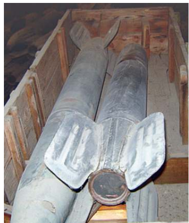
Medium range ground-ground rocket.

The operation of collecting and withdrawing weapons costs the state tens of billions of Riyals not only for buy-backs but also for logistics and inventory, especially that many of these weapons are very sensitive and can result in a devastating disaster if mis handled, according to an Interior Ministry's report. The report disclosed that Saudi Arabia and other Gulf states made pledges to extend financial assistance to Yemen to continue out this arm collection project.