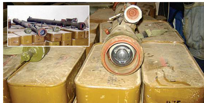
Surface-to-air missiles (SAM)