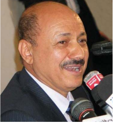
Dr. Rashad Al-Alimi recent of which was a bomb explosion near the Defense Ministry, causing serious injury to two children. One later died and the other still is being treated. Shiite Continued on page 3