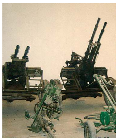
14.5 mm automatic dual cannon.