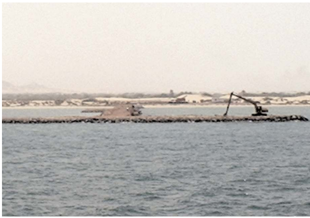
Breakwaters provided a safe shelter for fishermen boats especially from July to October when waves are strong.

Another YLNG project to compensate area fishermen is constructing breakwater in Jila'a, located some 7 km. west of the Balhaf coast. The breakwater is intended to provide fishing boats shelter during monsoons. Breaking the force of waves in the area will create calm water onshore where fishermen can pull up their boats. Depths behind the breakwater gradually will decrease