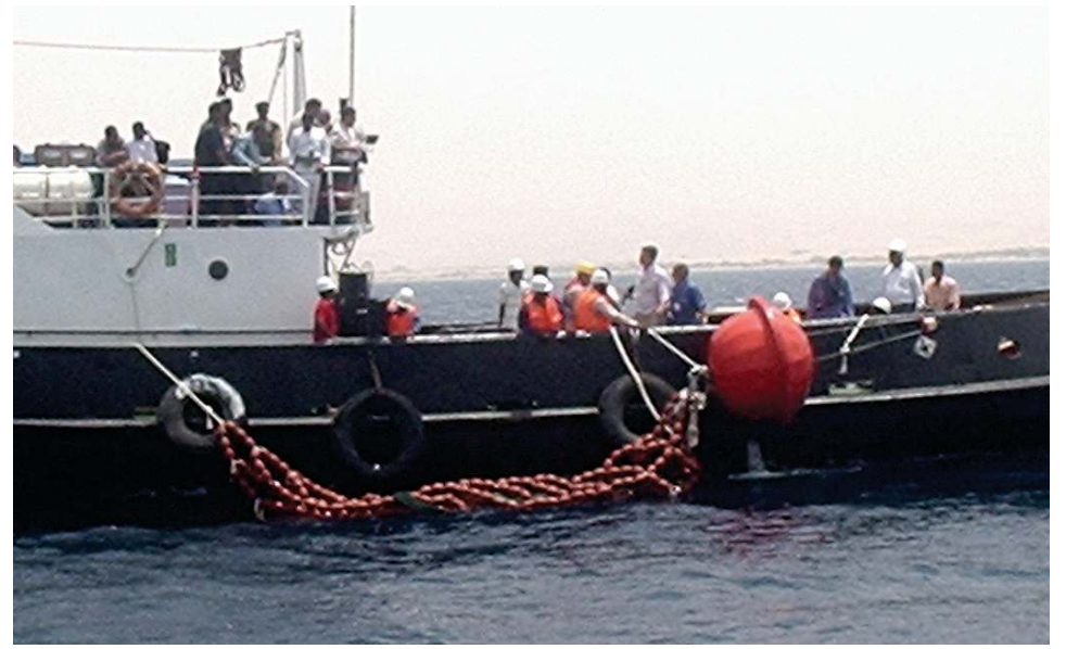
Fish aggregation devices (FAD) are expected to create a good environment for fish breeding.

"The company doesn't have the right to employ anyone without coordinating with and approval from the labor office here in Shabwa. However, some workers are employed through labor offices in Sana'a and Hadramout while others