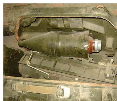
A brand new rocket head.