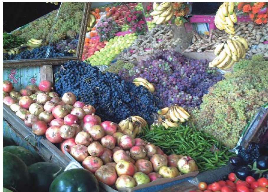
People of limited income are the most to suffer from high prices because they consider Ramadan as a time during which they eat many sorts of food that they don't usually eat throughout the year.

Ghalib added that people are unable to provide their families with essential food items such as flour, bread and milk, and this reflects in the low