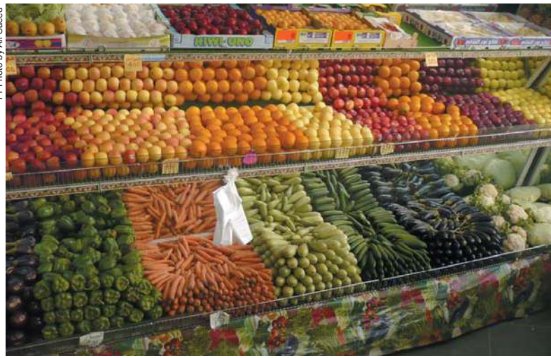
Despite the increase in fruits and vegetable prices, many people would rather buy from the market than grow the vegetables at home. YT Photo by Ali Saeed

"My mom was the one who insisted on growing some plants in our