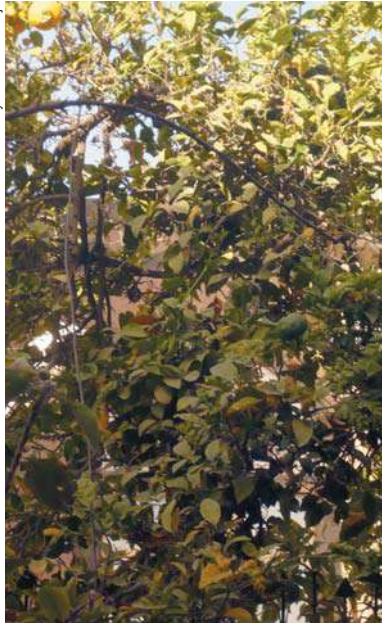
Most people with large yards prefer to grow fruit trees in their gardens rather than vegetables and herbs because of the nice view and shade the trees provide as well as the fact that they are easy to maintain.

Awareness of the dangers of chemicals used in agriculture and the importance of organic food is not common in Yemen. This is perhaps why home gardening in Yemen is not advocated,