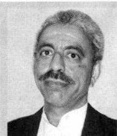
By: Hassan Al-Haifi

When for close to a century, a people become subjected to death, injury, imprisonment, continuous relocation, agony, separation from loved ones and a perpetually ominous threat of war, one is amazed more than to the rather lackluster concern of an international community that is complacent more with the perpetrator of all these misdeeds rather than it is at showing any compassion and mercy towards the helpless victims of these Godless acts.