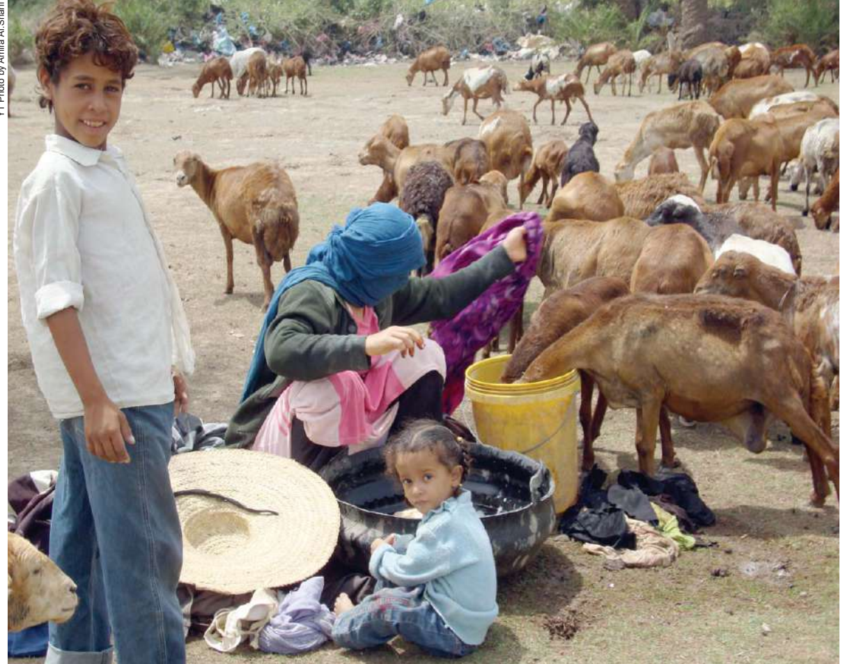
Animal wealth is one of the main sources of income for many Yemeni rural families.