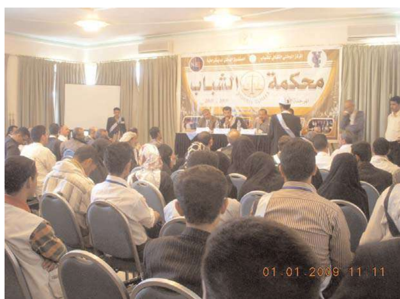
A Youth Court session on the education system, which is a simulation of an actual trial with defendants and prosecution demanding answers and action on a particular issue

Sallam added that these youths are trying to investigate why the curricu-