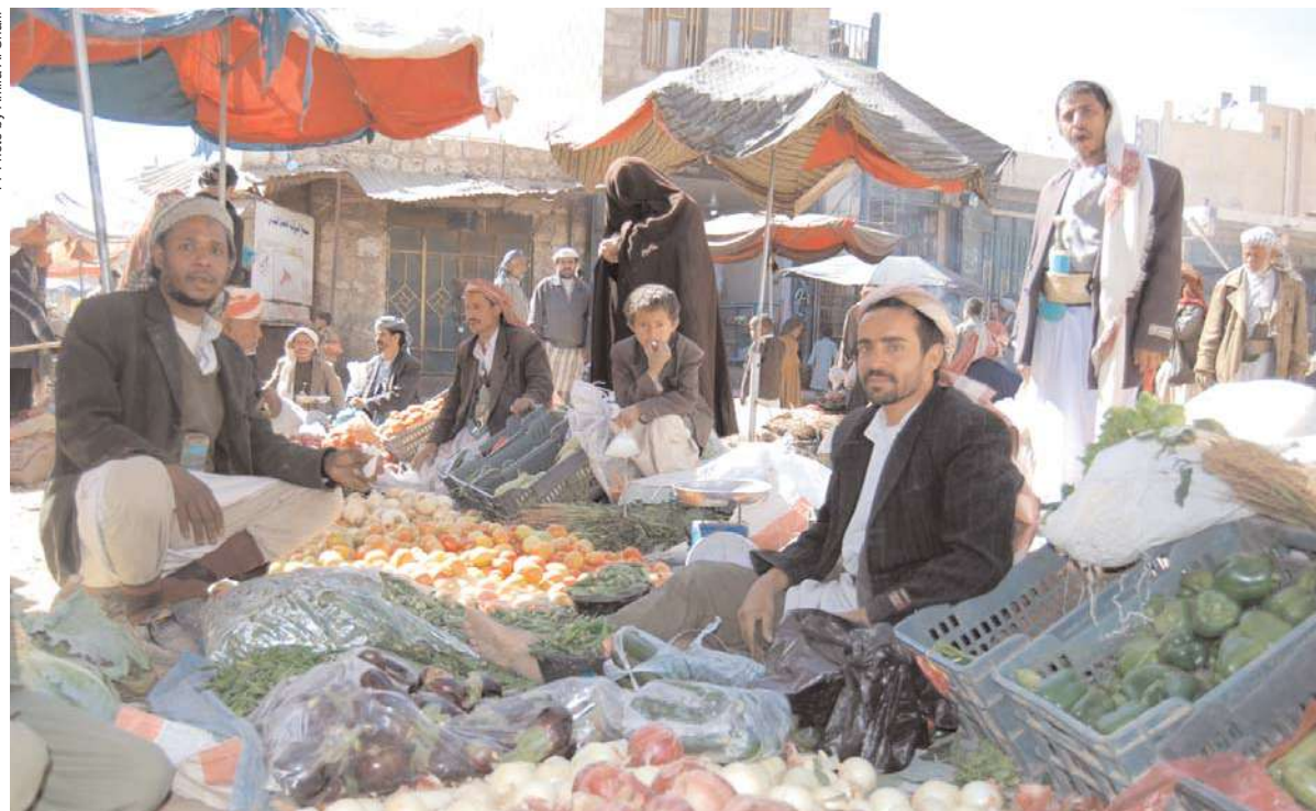
Amran popular market. Many Jews stopped their usual trade in the Amran popular market fearing they might be attacked or hurt by extremists especially in light of the Israeli aggressions on Gaza.

The observatory went on to say that the Jewish citizens were subjected to several forms of harassment over the