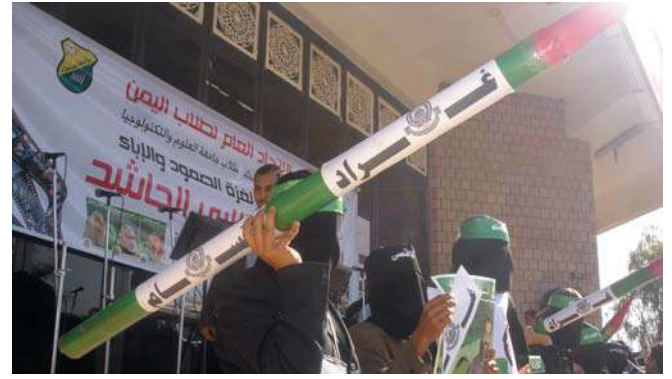
Hundreds of Yemenis continue their campaign in support of Gaza.

Assistant Deputy of the Ministry of Legal Affairs jointly with the women section of al-Quds foundation in Yemen.