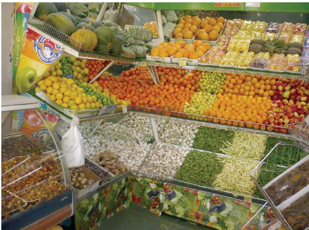
Yemeni non-oil exports including fruits and vegetables accounted for about 27 percent of export revenues in 2007

Finally, activating the developing activities that concern foreign market studies as well as raising the skills of the exporters and companies that work in this field through workshops and training courses that concern quality. Also, the plan includes strengthening the information center that belongs to the Yemen Export Supreme council to provide useful data concerning exportation to foreign markets and the chances there.