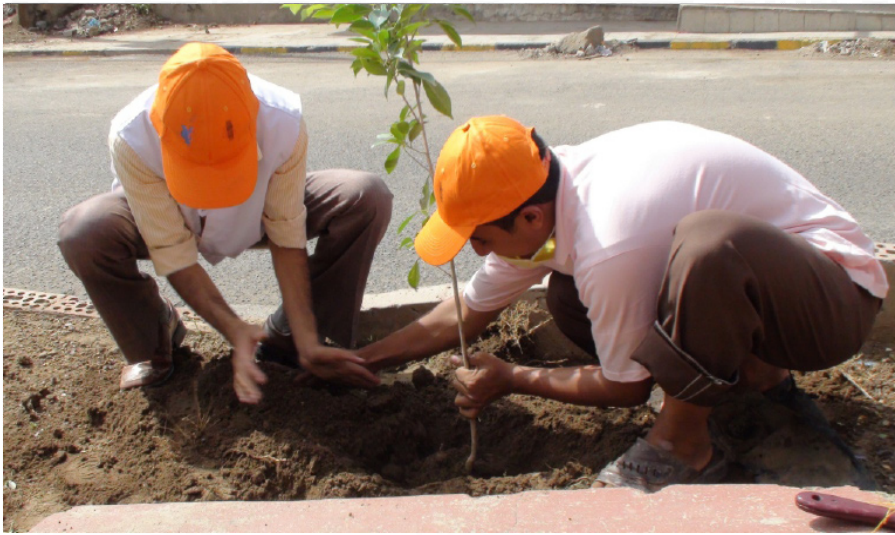
Eighty youth volunteers cleaned Al-Awadhi Street in Taiz planting seedlings and painting the sidewalk as part of a long term initiative towards the seventh Millennium Development Goal of protecting the environment.

Eighty young Yemeni men and women started off on a cleaning spree on Al-Awadhi street in Taiz last week. The youth are members and volunteers of the initiative.