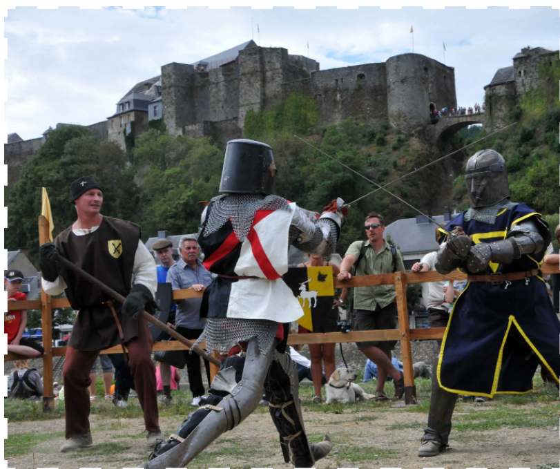
BOUILLON, Aug. 8 -- Two disguised swordmen compete during an annual Middle Ages presentation event in Bouillon, Belgium, Aug. 7.