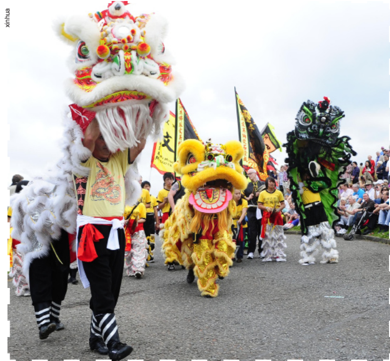
EDINBURGH, Aug. 8 -- A lion dance team organized by local Chinese communities attend the Edinburgh Festival's calvacade in Edinburgh, Britain, on Aug. 8, 2009. Sixty-one groups from across the world took part in the annual calvacade on Sunday celebrating the coming of the one-month festival season at the Holyrood Park.