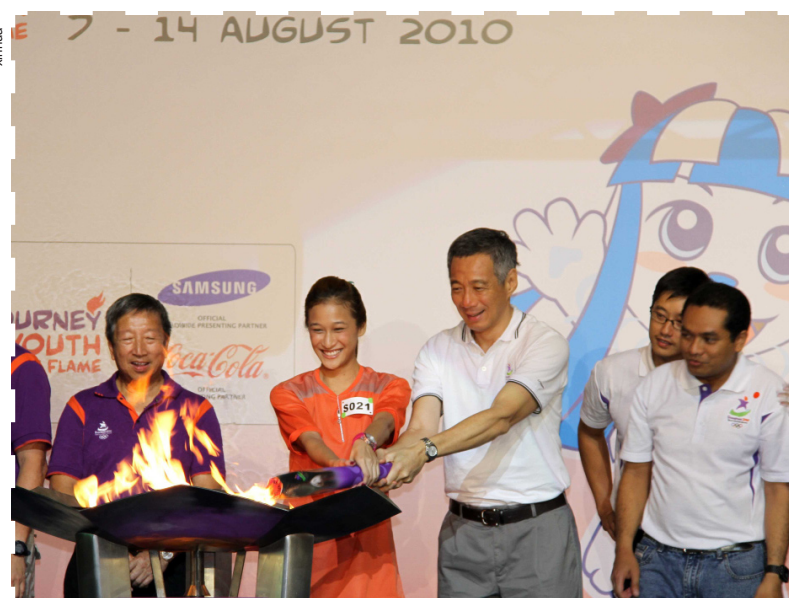
SINGAPORE, Aug. 7, Singapore's Prime Minister Lee Hsien Loong (3rd, R) and a torch bearer light the cauldron during a welcoming ceremony after the torch relay for the Singapore 2010 Youth Olympic Games at the Nanyang Polytechnic in Singapore, Aug. 3.