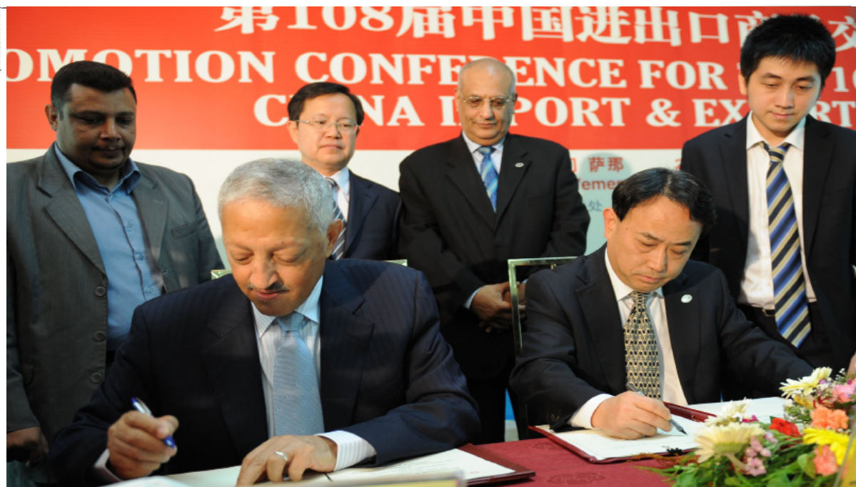
Chinese and Yemeni delegates sign the cooperation documents at the promotion conference for the 108th session of China Import & Export Fair (Canton Fair), in Sanaa, capital of Yemen, Aug. 8, 2010.

Xiangdong said in the conference that the international fair is a chance