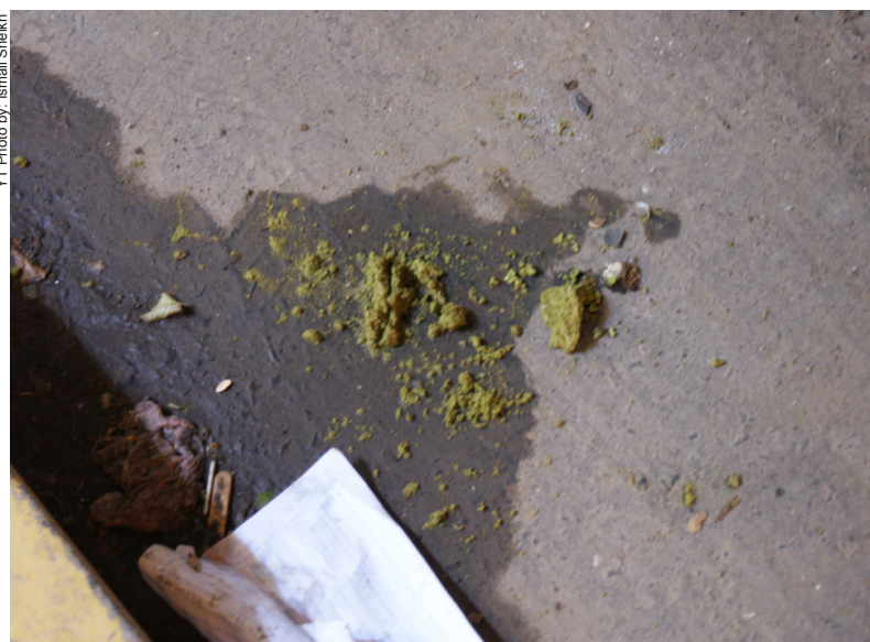
Qat remains in front of shop in Tahrir Square, in Sana'a, a place often visited by foreigners

"Regardless of whether qat is bad or not, the fact that some people spit it on the streets is something not pleasing