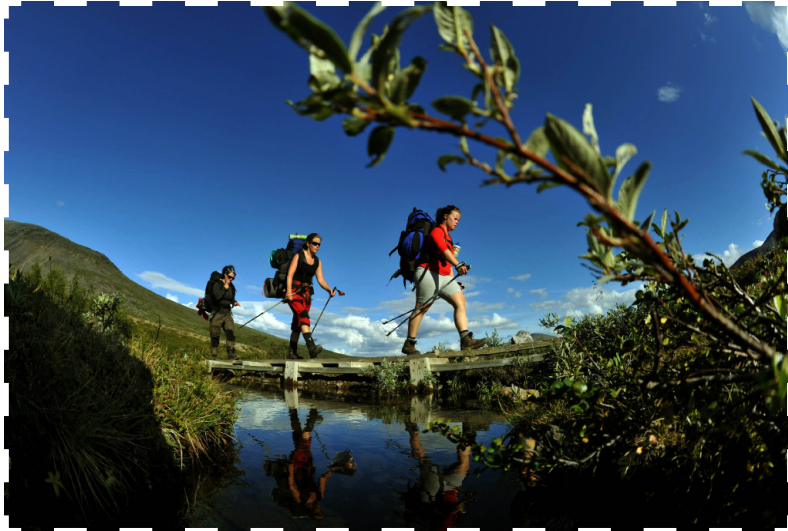
LAPLAND, Aug. 8 -- Three female participants from Sweden cross a bridge during the second round of the five-day-travelling Sweden event called "Green Arctic" in Lapland, Sweden, on August 7. The route begins from Swedish Lapland, 250 kilometers north of the Arctic Circle. The whole course is 110 kilometers. Some 2,000 participants from 21 countries and regions will fight for the gold medals if they finish the match in 72 hours, silver medals in 96 hours and bronze medals in 120 hours.