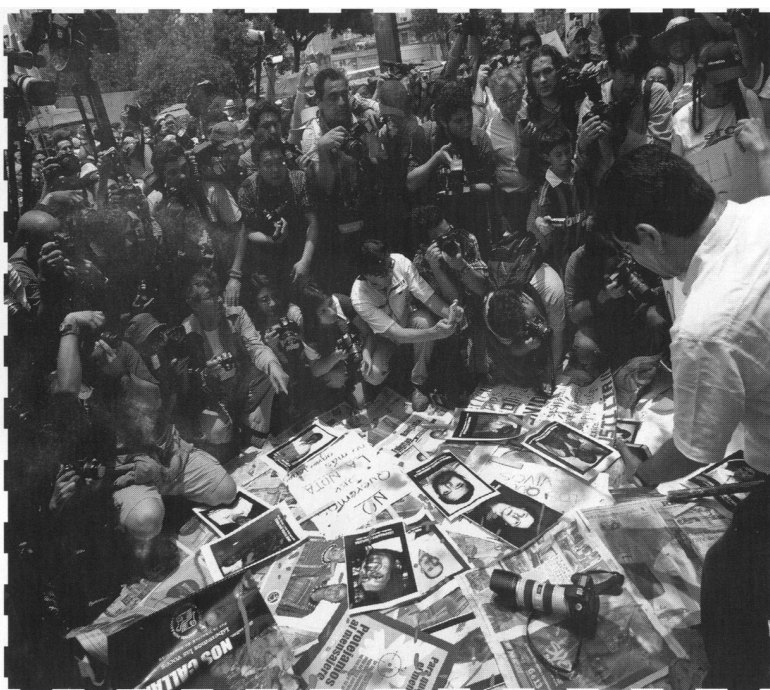
MEXICO CITY, Aug. 8 -- Cameras and photos of killed and missing journalists during a protest against violence towards journalists in Mexico City, Mexico, Aug. 7, 2010. Hundreds of journalists attended the protest triggered by the abduction of four journalists in the state of Durango on July 26.